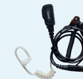
Audio tube Earpiece